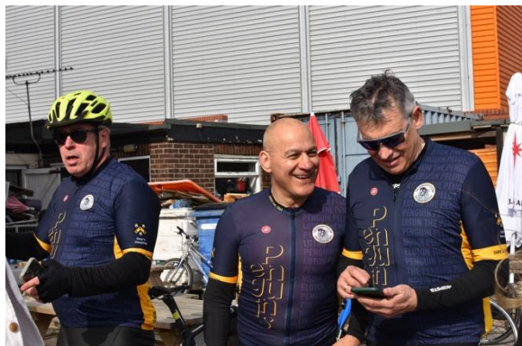
Googling 'Fair Maid of Kent'

The final stage was a fantastic ride through the South Downs National Park via Finchdean, Rowlands Castle ( which has a lung shaped village green ), West Leigh and Bedhampton before taking dinner at the Ship and Castle pub in Portsmouth ferry terminal - Another very well organised, prompt and hearty meal supported by real ale. We were also joined by the Macaroni Trio with a combined age of 200 years, before boarding the ferry for St Malo. Unfortunately, we lost a Penguin who had forgotten to bring his passport. As Windsor Davies would have said 'Oh Dear, How Sad, Never Mind'.