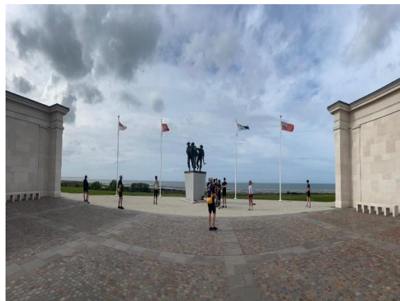
Quiet Contemplation at Ver sur Mer