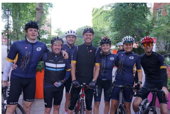
Penguins come in all shapes and sizes