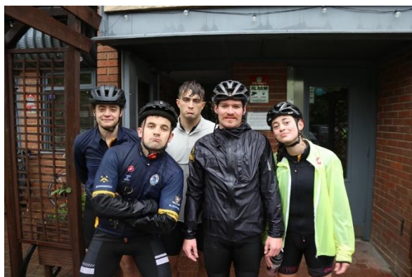
End of Day 1 2024 (161 km constant rain)