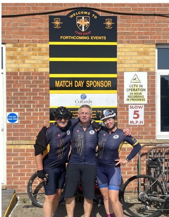
The 3 Degrees posing at Esher