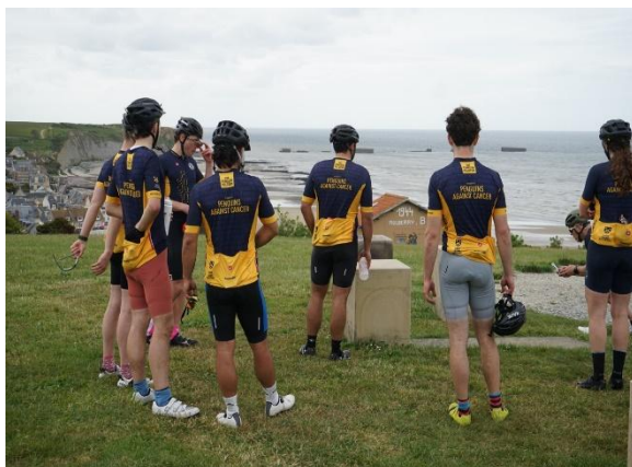
Arromanches - Mulberry harbour remains.