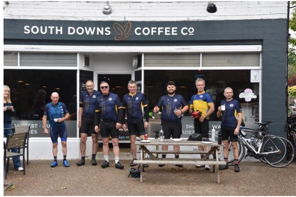
Coffee and cake in Elstead

The last leg was roughly the reverse of the first leg taken 3 days earlier. All navigated the delights of Bushey and Richmond Parks and then enjoyed the dust and grime of Central London before arriving at the Mother Ship. Showers, a change of clothes and an excellent meal in the Market Porter concluded a highly enjoyable 4 days.