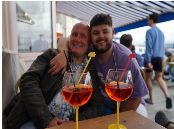
Jammin Good members getting Aperol friendly