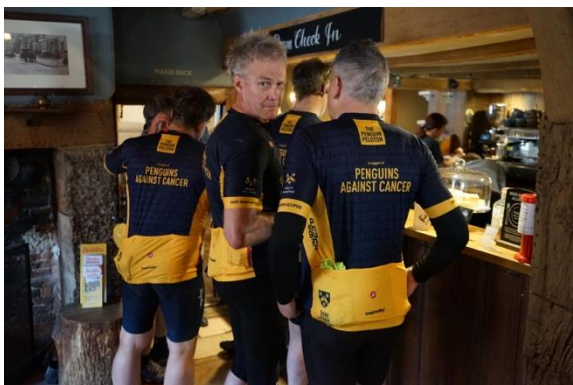
'He fixed on me his stony eye'