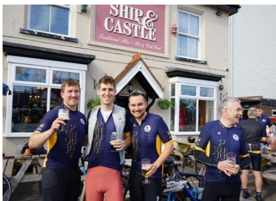
End of Day 1 2025 (141 km no rain)