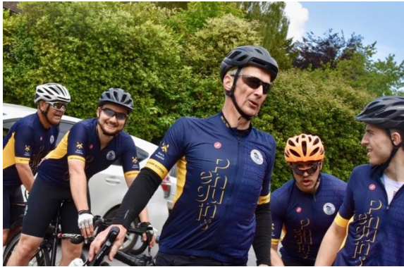
Ready for some refreshment

We were soon away again through Cobham ( Covenham in the Domesday Book ) and then experienced the joy of the Surrey Hills with plenty of up and down before arriving at the very well-appointed White Hart pub in Witley ( Witlei in the Domesday book, whose assets were held by Gislebert, son of Richere de L'Aigle ), where we had a very well organised and fulsome lunch, and some excellent real ale.