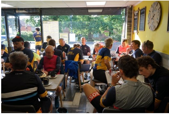
Full English at the Cowplain Café