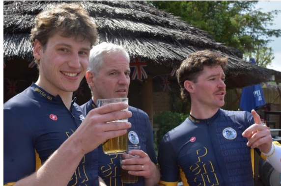
Excellent real ale

We continued via Haslemere, Milland, Rogate and Nyewood until we gained South Harting, where the painter Theodore Garman lived and worked. Following best practice, we settled at a pub called the White Hart ( personal badge of Richard II, possibly derived from the arms of his mother, Joan 'the fair maid of Kent' ) for refreshment.