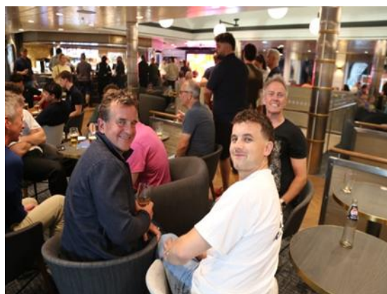
Carbloafing after the AGM